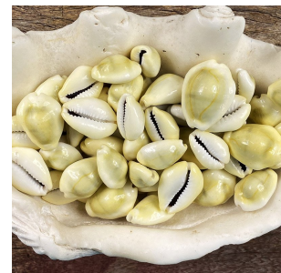
Cypraea moneta , a type of cowrie shell found worldwide, was long used as money in most continents and is still an accepted currency in some places.

For at least 5,000 years, anything to which a local population ascribed value, which could be carried about comfortably and easily safeguarded, and which would not deteriorate too quickly served as a medium of exchange — as money. In time, precious metals replaced most other commodities. The difference in value between gold and silver was due to the perceived relative scarcity of each and due to any one metal's usefulness for ornamentation and so on. Units of gold and silver as well as a few other precious substances could buy just about anything available in any culture, in any time.