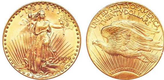
1929 double eagle ($20 gold piece)