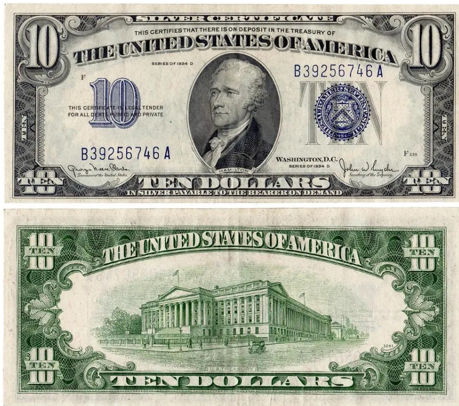
silver certificate, series of 1934

would receive $20.67 per troy ounce in paper money: National Currency, Federal Reserve Notes, or Silver Certificates.