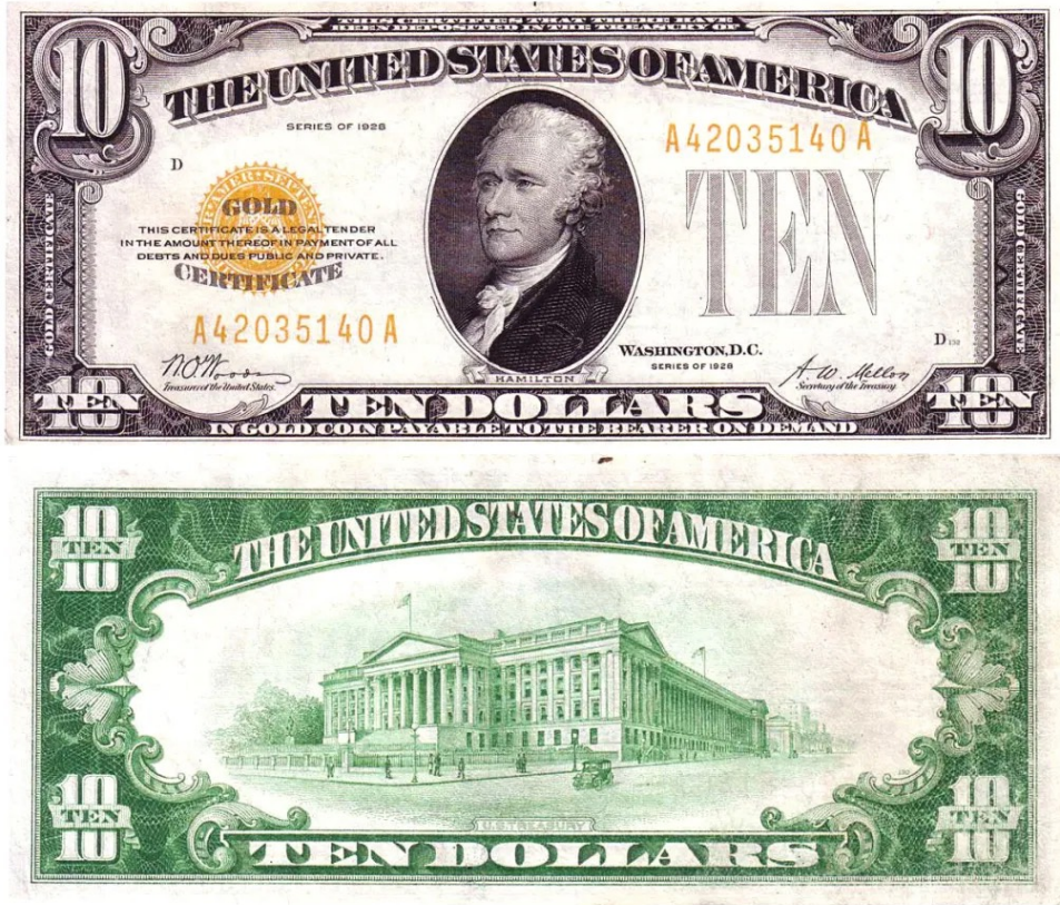
gold certificate, series of 1928

today), and if a bank held any of it for you, you could accept gold certificates or silver certificates in exchange. At any time, though, you could demand — ("payable to the bearer on demand") — the certificates' stated value in gold coin. Or in silver — the bank was flexible.