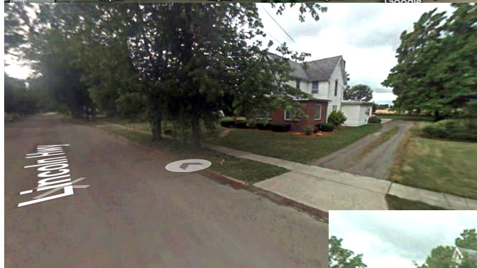
Gomer in 2021 from Google Maps, red marker on our house in aerial photo