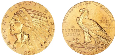
1929 U.S. $5 gold piece

Also see Wealth from a Child's Perspective