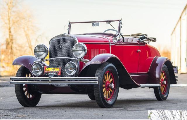
above: 1929 DeSoto K Roadster, below: 1929 Buick Doctor's Coupe, both with wooden wheels